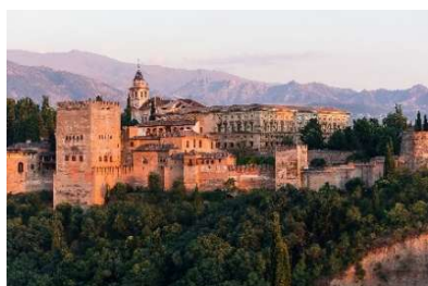
The Alhambra Palace

Recuerdos de la Alhambra ( Memories of the Alhambra ) is a classical guitar piece composed by the iconic Spanish composer and guitarist Francisco Tárrega in 1899. The piece conveys the impression of flowing water, shimmering light, and the Moorish grandeur of the palace, all through the delicate interplay of notes that swirl and cascade, much like the fountains and courtyards of the Alhambra itself. The Alhambra has long been a source of inspiration for artists, poets and