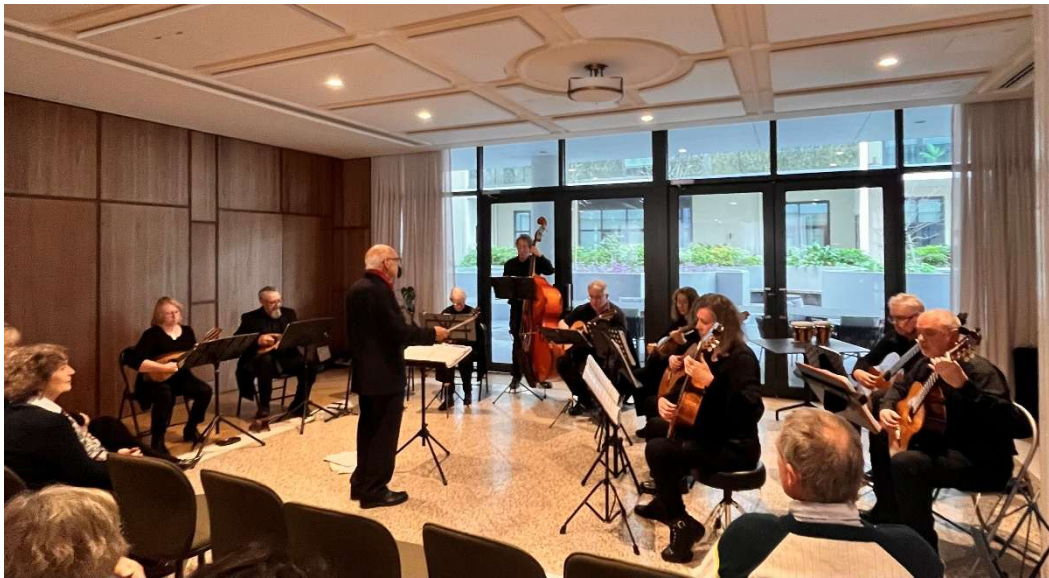
Concordia in concert at Airlie in July 2024