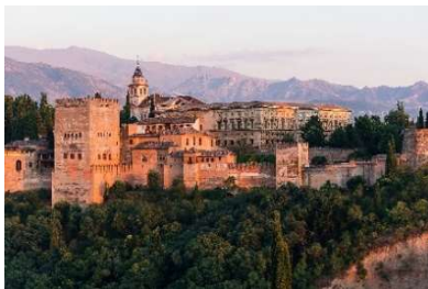
The Alhambra Palace